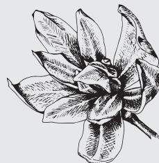
Golden Champa Magnolia champaca

Some of this may seem obvious but, we can all use a friendly reminder from time to time! Keep candles out of reach of children and pets. If you have a pet octopus, or many children this may be difficult :) Never leave a burning candle unattended. Keep wood wick trimmed to 1/4" and centred to prevent a large flame.